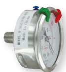
SGZ back with accessory pointers