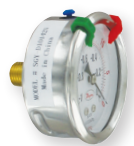
SGY back with accessory pointers