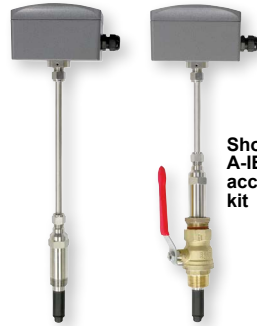
Shown with A-IEF-VLV-BR** accessory valve kit