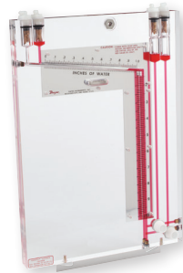
Inclined-vertical manometer double column